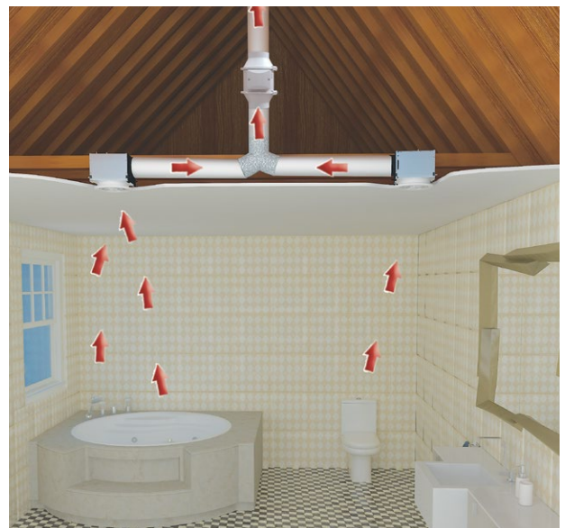
Dual ventilation kit installation