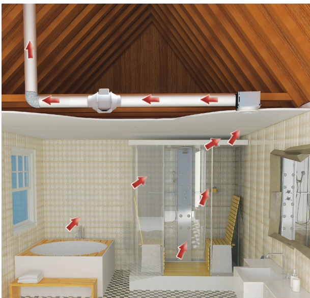
Single ventilation kit installation