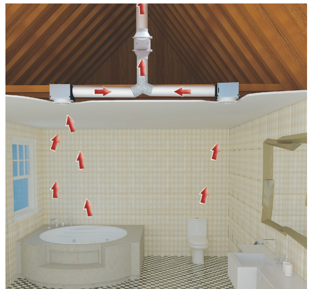
Dual ventilation kit installation