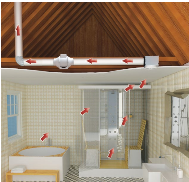
Single ventilation kit installation