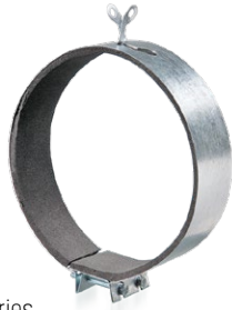
CZ - series