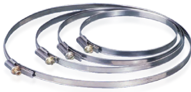
C - series