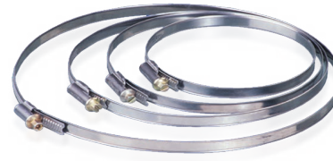
C - series

The clamps are designed for quick and reliable mounting and connection of various round ventilation system components. The clamps facilitate the installation and removal of fans for maintenance and cleaning.