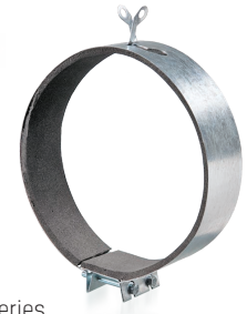
CZ - series